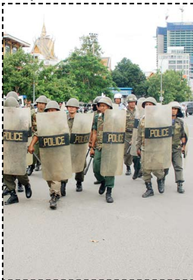
Demonstrating residents were met with force

Even though I accepted US$10,000, I am not happy because I have lived at Boeung Kok for a long time. The money will not make me happy. I am so sad about this outcome. For three years I fought, I organised, I joined meetings... I was happy to do that in my mind I always believed my fellow residents would understand and see what the company was doing to us. If we had been able to mobilise more people early on, I think we could have succeeded. Now, I feel like we failed."