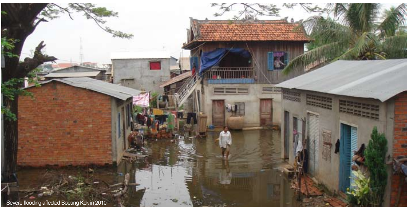
Severe flooding affected Boeung Kok in 2010