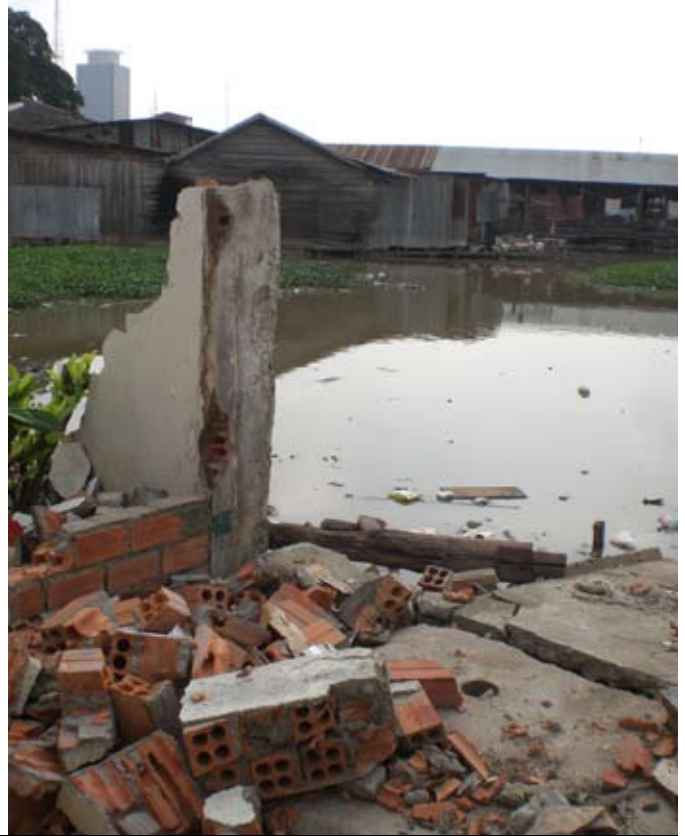
Houses on the lake were the first to be targeted