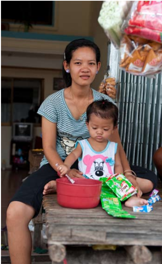
Damnak Troyung relocation site