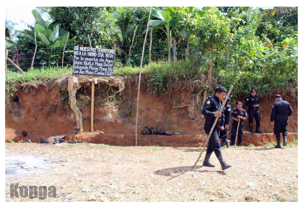
The IFC failed to classify the Santa Rita project as high risk despite severe conflict and repression of local indigenous communities.

However, it is extremely difficult to verify the IFC's figures relating to what proportion of its FI portfolio it classifies as high risk. This is largely because there is no transparency about the majority of projects supported by the IFC's FI clients, so there can be no independent verification of its claim. Until there is full disclosure—something CSOs and communities have been pressing for—we must simply take the IFC at their word. However, given the magnitude of IFC investments in the financial sector and the failure of the IFC to track and monitor its investments, it is probable that the scale of problem projects is in fact much greater than claimed.