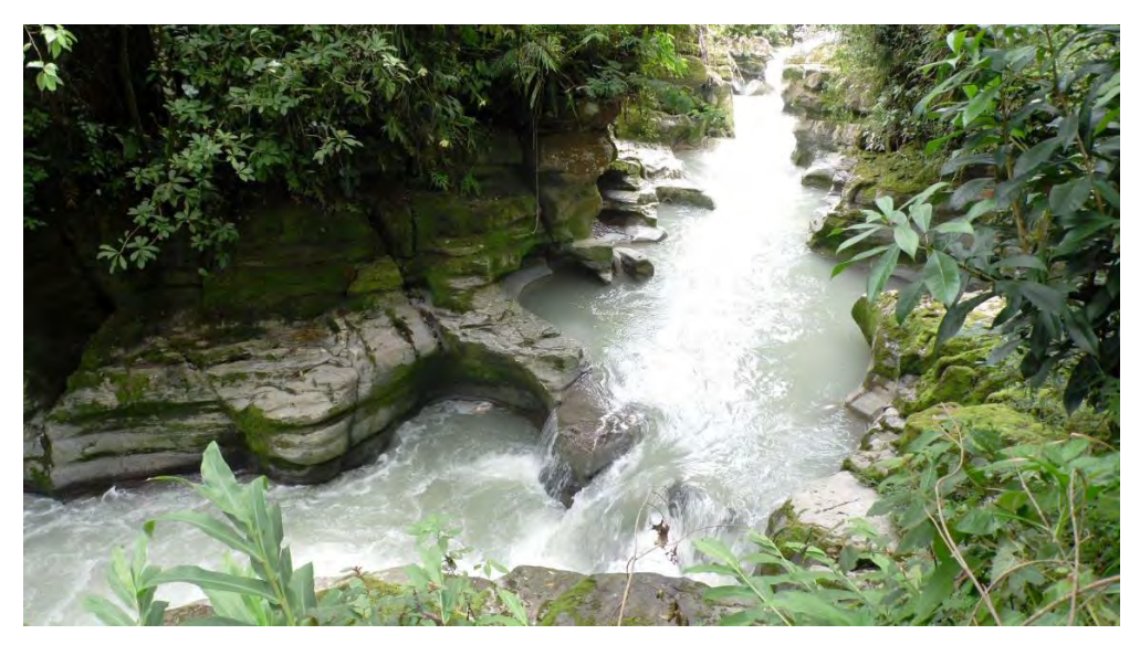
The Q'anb'alm River, site of the proposed Cambalam dam, owes its name to the local Mayan language Q'anjob'al, which means 'Yellow Jaguar'.

are limited', and committed to conform to the IFC's Performance Standards on indigenous peoples, environmental and social impacts, and land acquisition.<sup>60</sup>