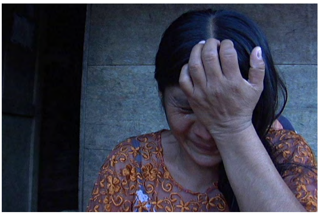
An indigenous woman in Monte Olivo, Guatemala, whose community has suffered repression linked to an IFC-backed project.

The human cost of the International Finance Corporation's lending through financial intermediaries