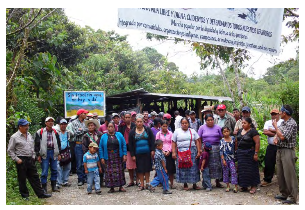
Women and men of Barillas maintain a passive resistance and reject the construction of a hydroelectric dam.