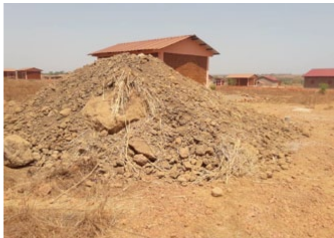
New Hamdallaye resettlement site lacking topsoil