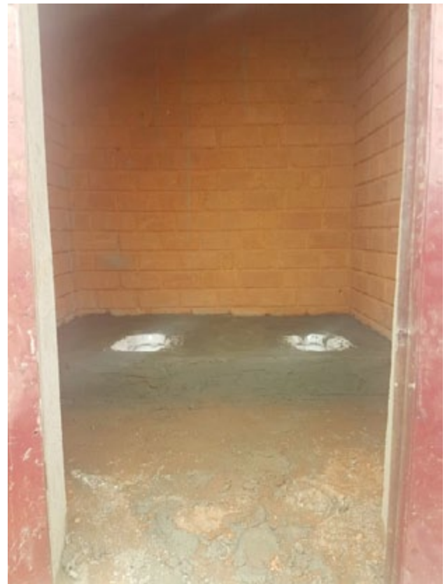
Toilets lack privacy and are poorly constructed

Hamdallaye residents have reported that the quality of the housing is poor and the infrastructure at the site is inadequate, particularly in relation to water and sanitation. Toilets are poorly constructed due to the shallow depth of the latrine pits, which has led to foul odors, clogging and unsanitary conditions. CBG has constructed