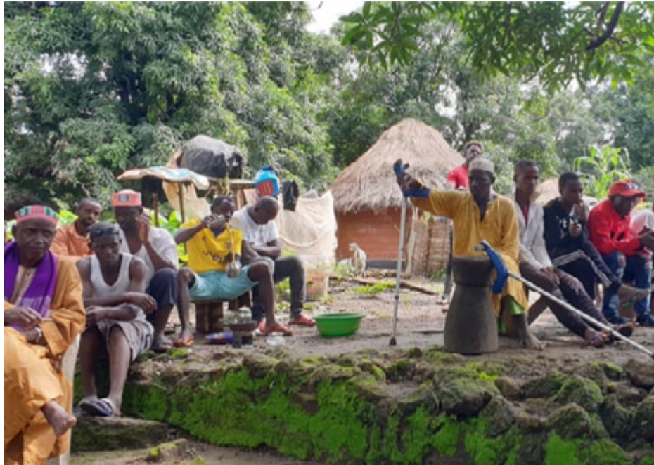
Old village of Hamdallaye situated among lush vegetation.