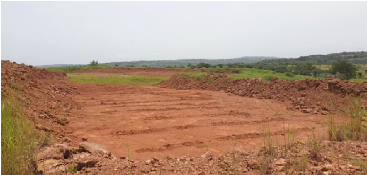
Exploited land near the villages of Cogon Lengue and Ndanta Fogne which CBG claims has been 'rehabilitated'. Residents report that CBG has periodically visited communities and informed them that land is being restored. Residents report that they have had no success growing crops, and that the land appears sterile due to the absence of topsoil. Similar plots of 'rehabilitated' land are widespread in other affected communities within CBG's concession.

Indeed, Ramboll's 2019 evaluation of livelihood support measures states: "Beyond [...] preliminary awareness and training, no tangible support has been provided". 13 The community continues to be frustrated by the lack of effective livelihood support. For instance, the women of Hamdallaye withdrew from the process of setting up a market garden after the NGO hired by CBG asked them to collect cow dung around the village to make compost, but never trained the women on composting, leaving the collected dung heap to fester. In Hamdallaye's sister village, Fassaly Foutabhé, community representatives report that the program implemented by the same NGO included activities that the community was unaware of or had not identified as needed, such as vegetable gardening or small ruminants. The pro-