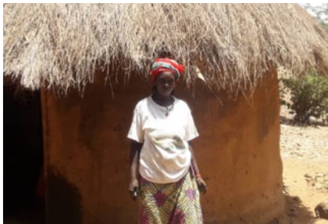
Widow with seven children has not been given replacement housing

18, 2015. When resettlement did not occur after one year, CBG should have updated their asset inventories and communicated the new schedule for resettlement to the communities. CBG began updating the inventories in 2017, but in the period since the original inventories had been conducted, some houses had collapsed. Community members report that during the 2017 inventory update, CBG did not account for these collapsed homes in their records even though they were initially counted during the first inventory. Now, CBG is refusing to compensate households for homes that collapsed.