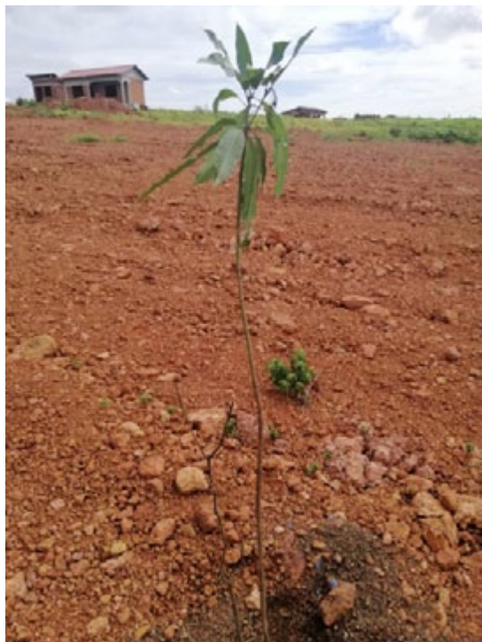
Trees planted by CBG one year ago on the barren land at the resettlement site show little sign of producing shade in the near future.

Topsoil is essential for vegetation; without it, the resettlement site will remain uncultivable. CBG claims to have planted more than 3000 trees and plants at the site, with a 55% success rate. However, Hamdallaye residents report that the trees CBG planted a year ago - if they survived - have shown little growth and provide no shade to shelter them from the intense heat, unlike their lush former village.